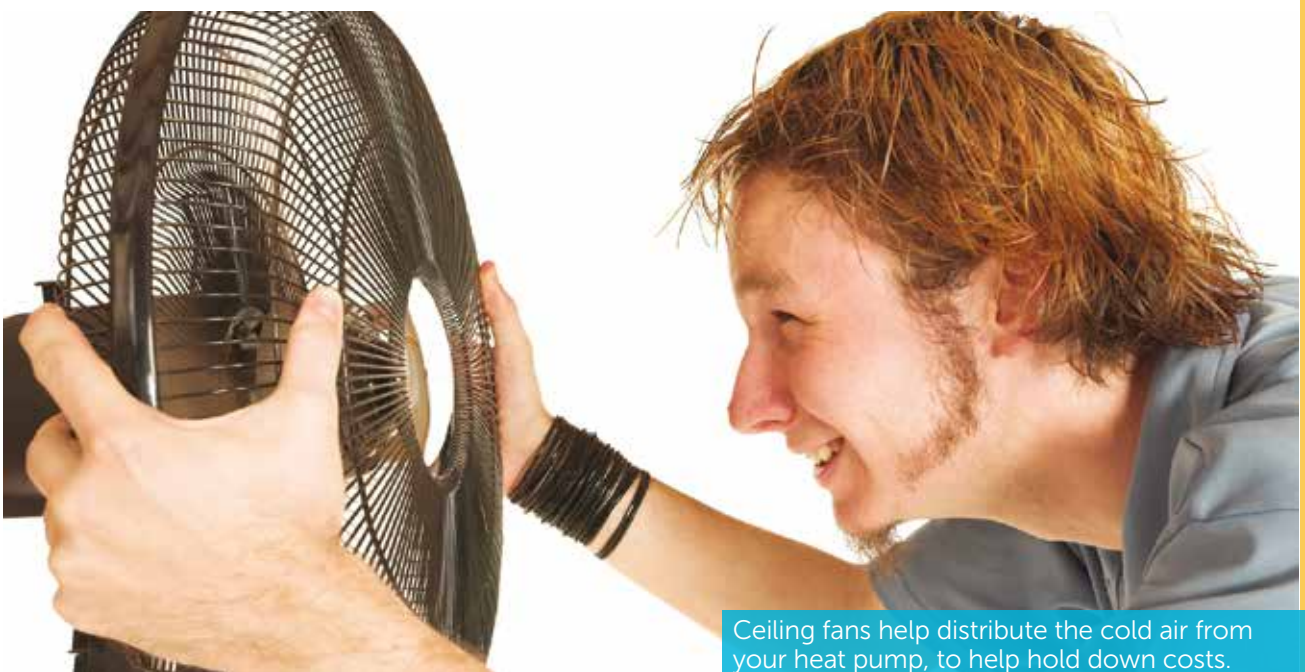
Ceiling fans help distribute the cold air from your heat pump, to help hold down costs.

the seasonal energy efficiency ratio, or SEER, rating the better the system is at meeting the heating or cooling demand. Find out how much a new system could save you by using the heat pump calculator at sremc.com . You can also read up on the rebates offered, or call 910.892.8071x 2152.